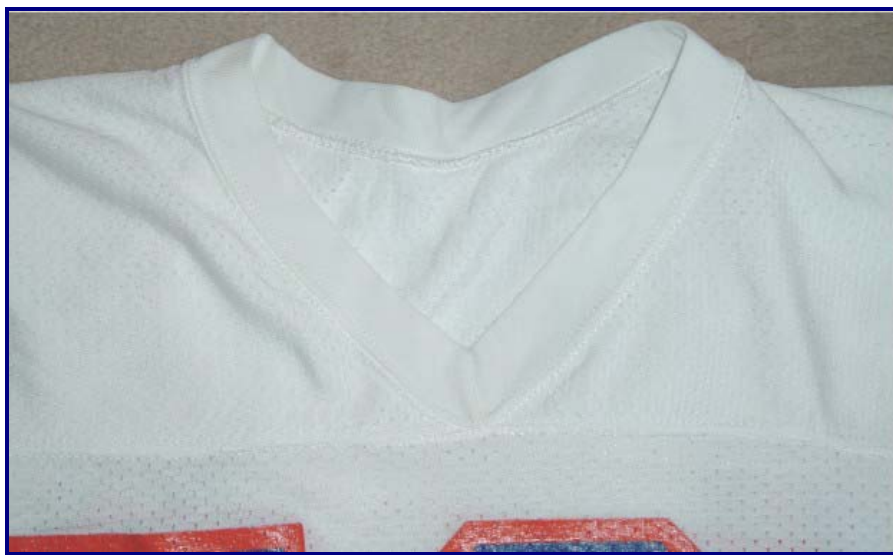
Fig. 87-7. Collar detail from 1987 road jersey.