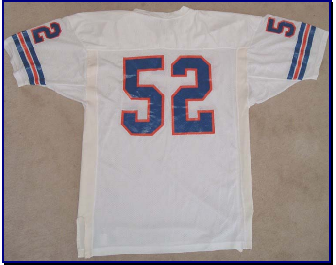
Figs. 87-3 & 87-4. Front and rear of 1987 road jersey