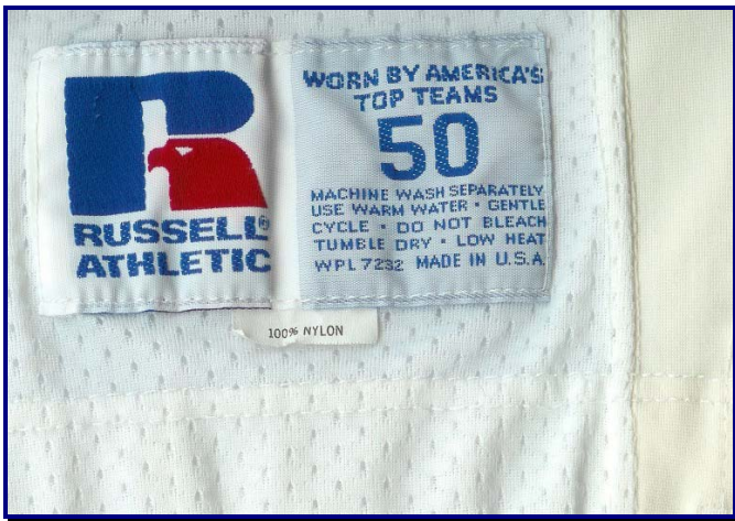
Fig. 87-5. Manufacturer's tagging from 1987 road jersey.