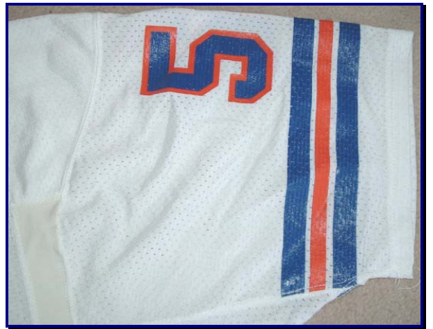
Fig. 87-6. Sleeve detail from 1987 road jersey.